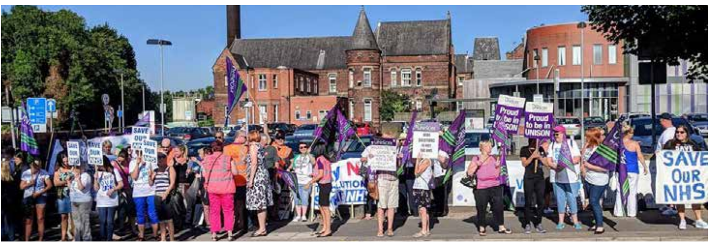
Determined strikes at Wrightington, Wigan and Leigh defeated management plans to outsource staff to a new "wholly-owned company" - and appear to have set a new tone of militant resistance by health unions against privatisation and contractors

A campaign by the GPC (General Practice Council) has been ongoing since early 2016.