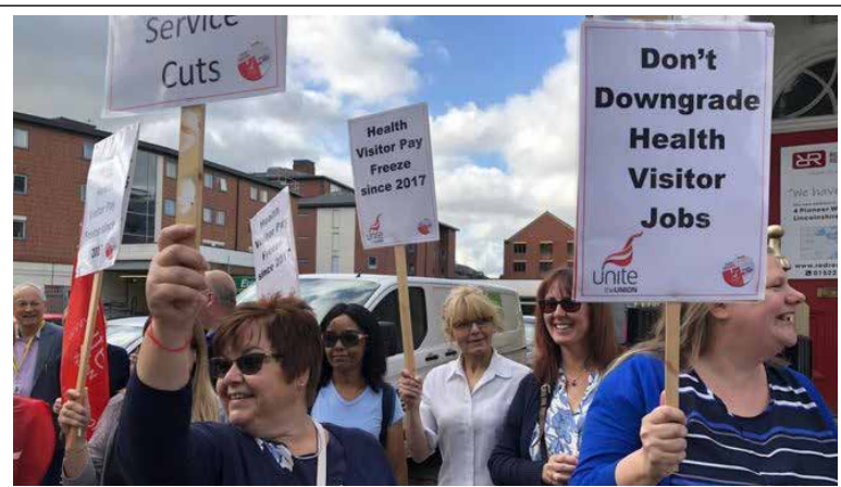
Unite has hailed <u>victory</u> in the long-running Lincolnshire health visitors' dispute, which is coming to an end with the vast majority of the workforce being upgraded onto the grade 10 pay scale.

The trust has told staff that "The money is not a free gift but is a bit like an 'interest only mortgage' — we will make an annual dividend payment on the sum provided but we won't be asked to repay the principle sum. The extra cost pressure due to