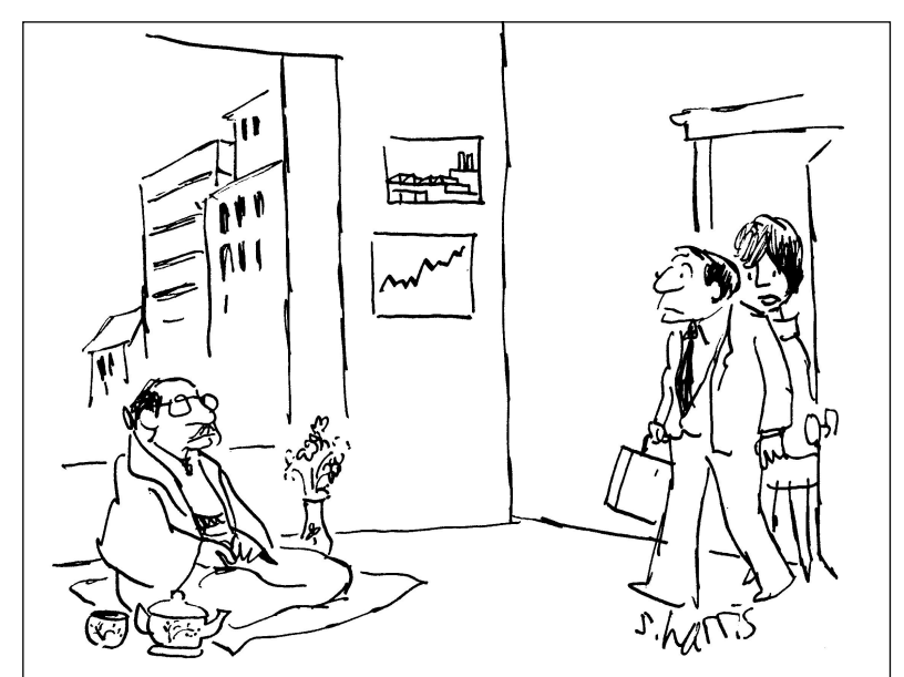
Our management team have become really keen on those Japanese management techniques

They may not be impressed or enlightened by news that "The improvement methodology has been utilised to test the sustainability of the plans put in place by the ISG's for example the use of Genba walks."