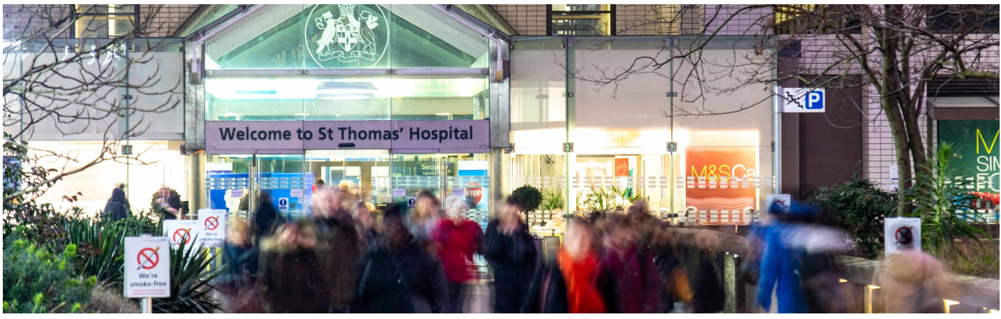
NHS normal activity in January 2020. Unions saying to employers we need to get the NHS back to more normal services - safely