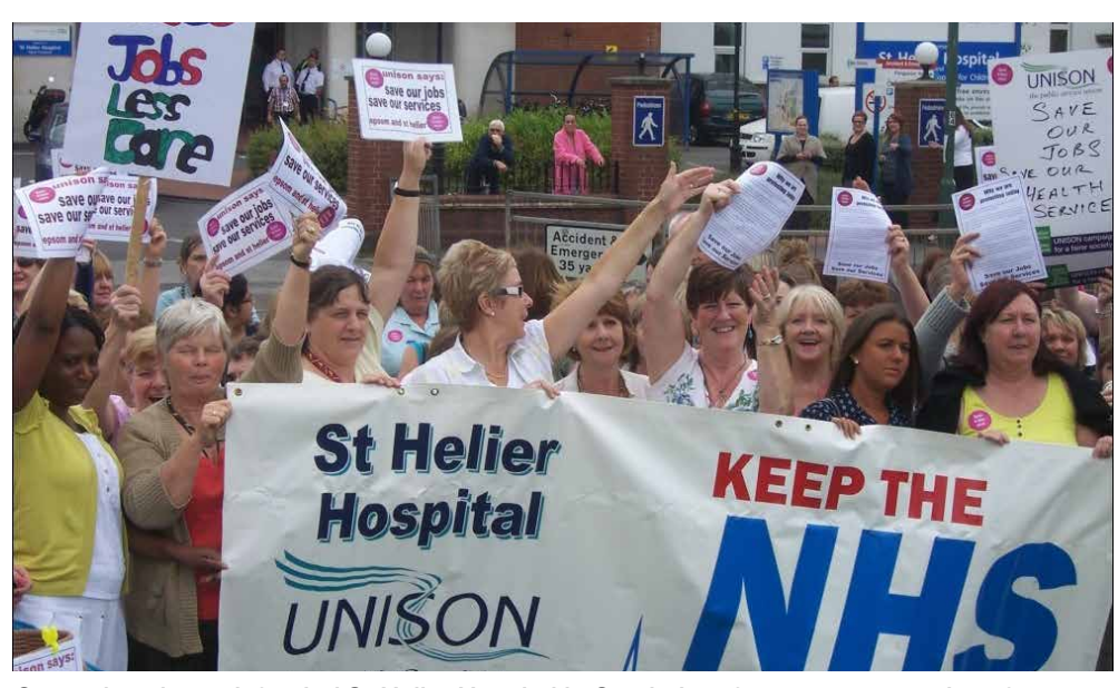
Campaigns have defended St Helier Hospital in Carshalton for years: – now plans for a new hospital in Sutton would downsize and downgrade it – halving numbers of acute beds

The real intention is not to recruit additional trainees (the Tories cut numbers of medical training places post 2010) or to help local or international recruitment (badly affected by Brexit and additional immigration controls): both of these would be much more expensive to deliver. Instead the aim is to deliver a smaller NHS, requiring