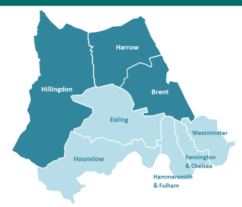
The North West London Footprint