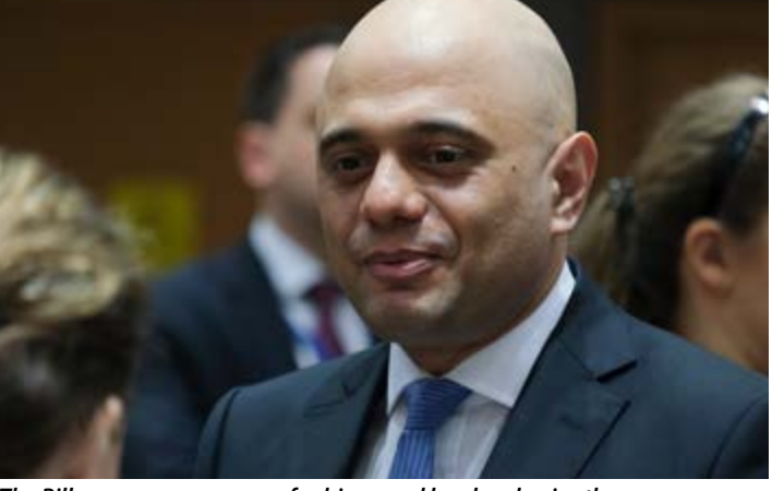
The Bill means more powers for him - and less local voice than ever

The 2012 Act ended the direct accountability of the Secretary of State for the promotion and provision of health services in England, which was transferred to an 'arm's length' body, NHS England – although in practice Health Secretaries have continued to behave as if they were still in charge.