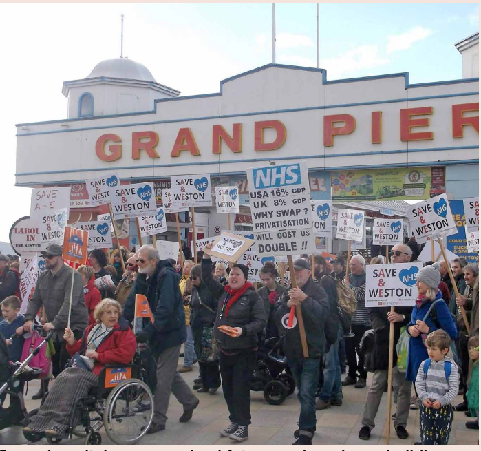
Some hospitals are promised future cash and new buildings: others like Weston are still facing cash-driven A&E closures

"The NHS' annual capital budget is now less than the NHS' entire backlog maintenance bill (which is growing by 10% a year)."