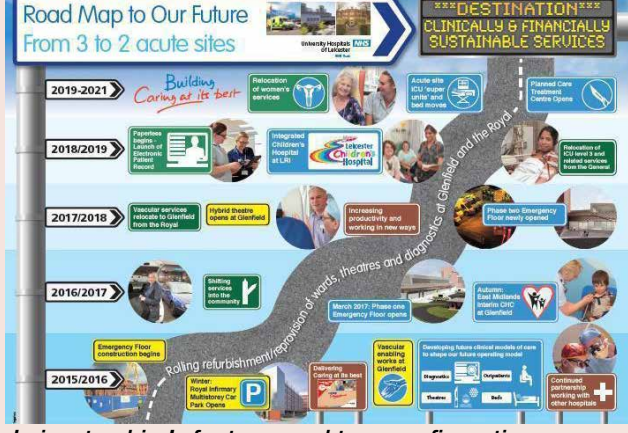
Leicestershire's fantasy road to reconfiguration

In Leicester a preconsultation business case, to be a staggering 1800 pages long has been kept carefully under wraps, apparently for fear of local campaigners