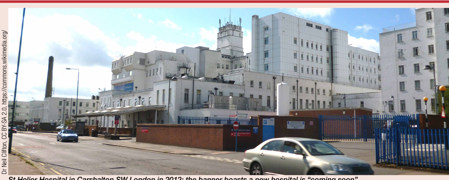
St Helier Hospital in Carshalton SW London in 2012: the banner boasts a new hospital is "coming soon"

outpatient and diagnostic services, an urgent treatment centre - and little more than half the 748 'core beds' that were available in Epsom and St Helier earlier this year. An 'Issues' document last year stated clearly that "any potential solution with more than one major acute site ... is eliminated".