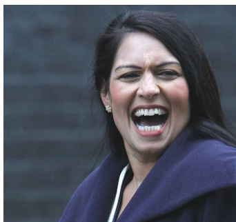
Priti Patel – creates a hostile environment wherever she goes

"It was really challenging. I had many sleepless nights, not knowing when I might get infected. It was a terrible experience seeing so many