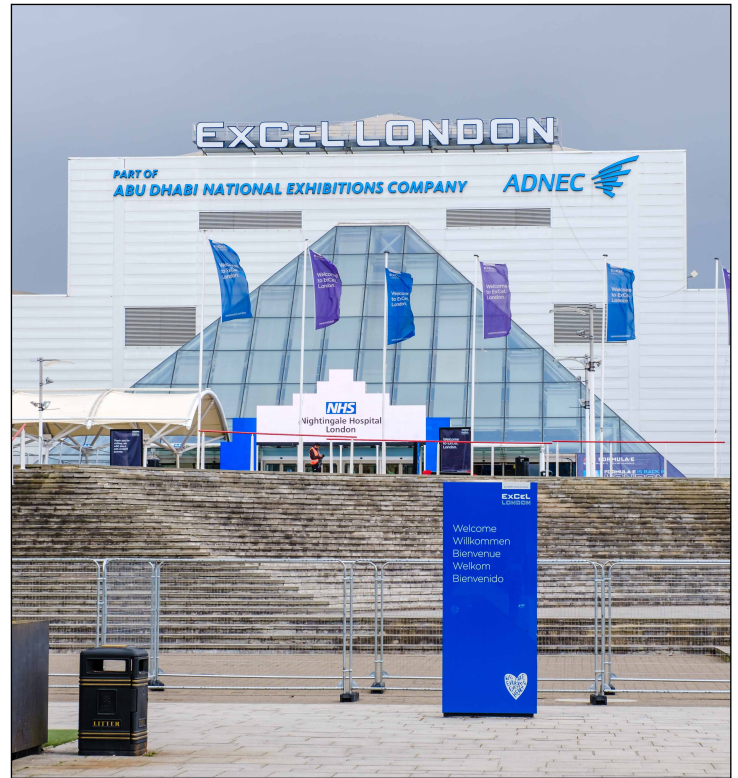
Nightingale hospitals have remained a white elephant for lack of staff

However not all of this latest situation is down to Covid. A decade of frozen funding had reduced