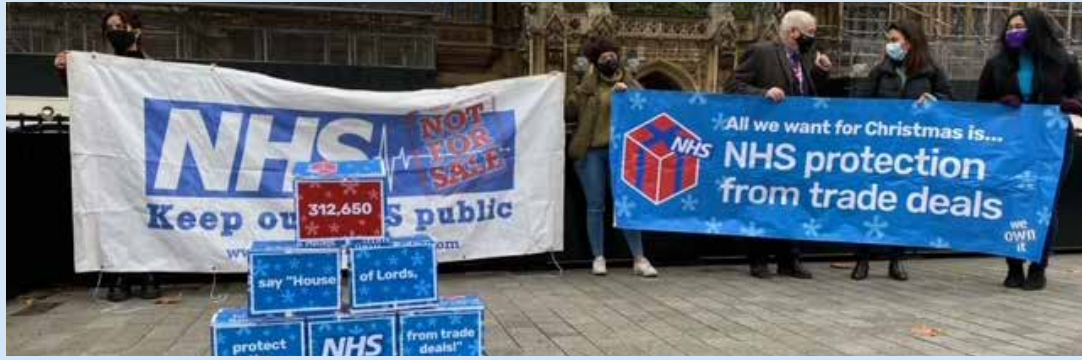
On December 7 We Own It and Keep Our NHS Public handed in a 315,000 strong petition to the Lords

MONTHLY ONLINE NEWS BULLETIN #3 DECEMBER 2020